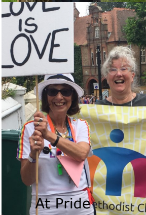
At Pride Methodist Ch