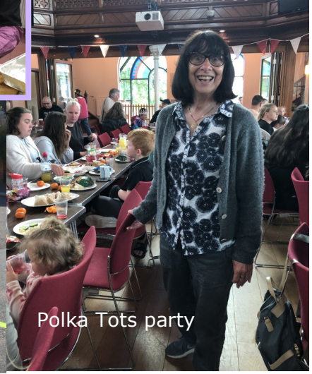
Polka Tots party