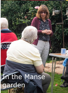
In the Manse garden