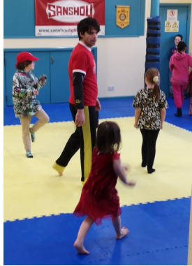
Cards, flowers, and kick-boxing oh my